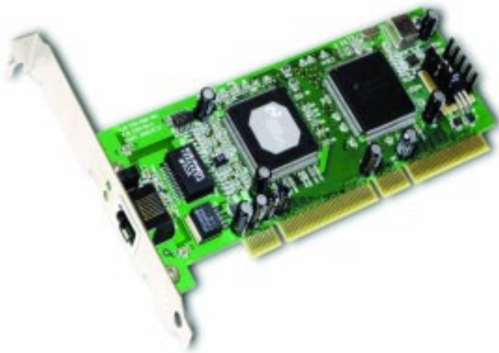
Instant Gigabit Network Adapter (64-Bit) (EG1064)